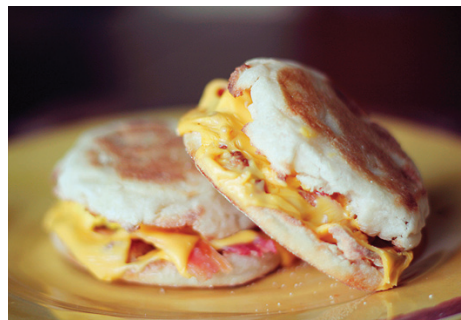
Recipe from www.bloglovin.com

3 Or 1 slice of light cheddar cheese (around 80 calories a slice)